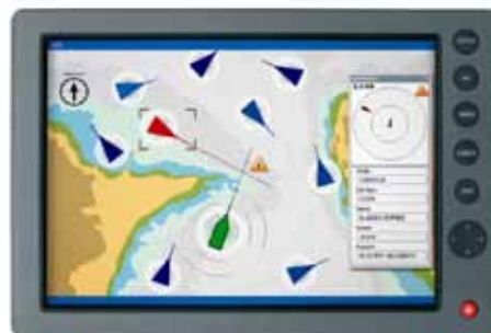
WITH AIS RX CARBON