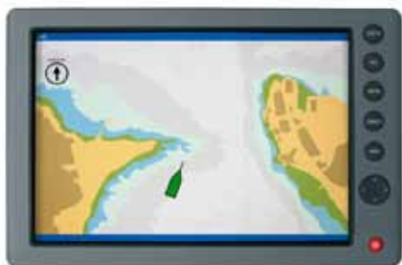
WITHOUT AIS RX CARBON

The AIS RX CARBON is an Automatic Identification System (AIS) receiver with full dual channel capability something required for full AIS performance. The AIS RX CARBON can receive all types of AIS messages and display in a suitable application like a plotter or PC. The RX CARBON with its low price provides a possibility to have your first AIS product to increase your safety in navigation. The benefits with AIS are already starting to get widely known and the AIS RX CARBON will provide the best possible quality and performance to join the growing group of AIS fans.